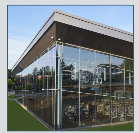
CHARDON SQUARE HERITAGE HOUSE